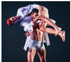
The Downstairs / Shared Program