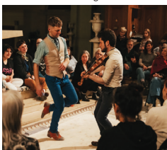
The Club / Shared Program