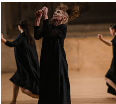
Ellen Stewart Theatre