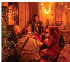
Community Art Space / Shared Program

Rooted in the dance, music, and storytelling traditions of the Dayak tribes of Borneo, Indonesia, who are grappling with multiple existential challenges. These tribes are struggling with environmental destruction, land theft, illegal logging and palm oil plantations. Forests are destroyed by unchecked greed, with no regard for the suffering of earth's creatures. This performance gives voice to the Indigenous resistance striving to restore denuded forests against all odds.