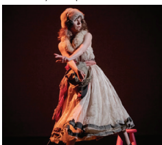
Community Arts Space

marion spencer SYMPHONY Xin Ying Piper Dragon: Five Elements Matrix