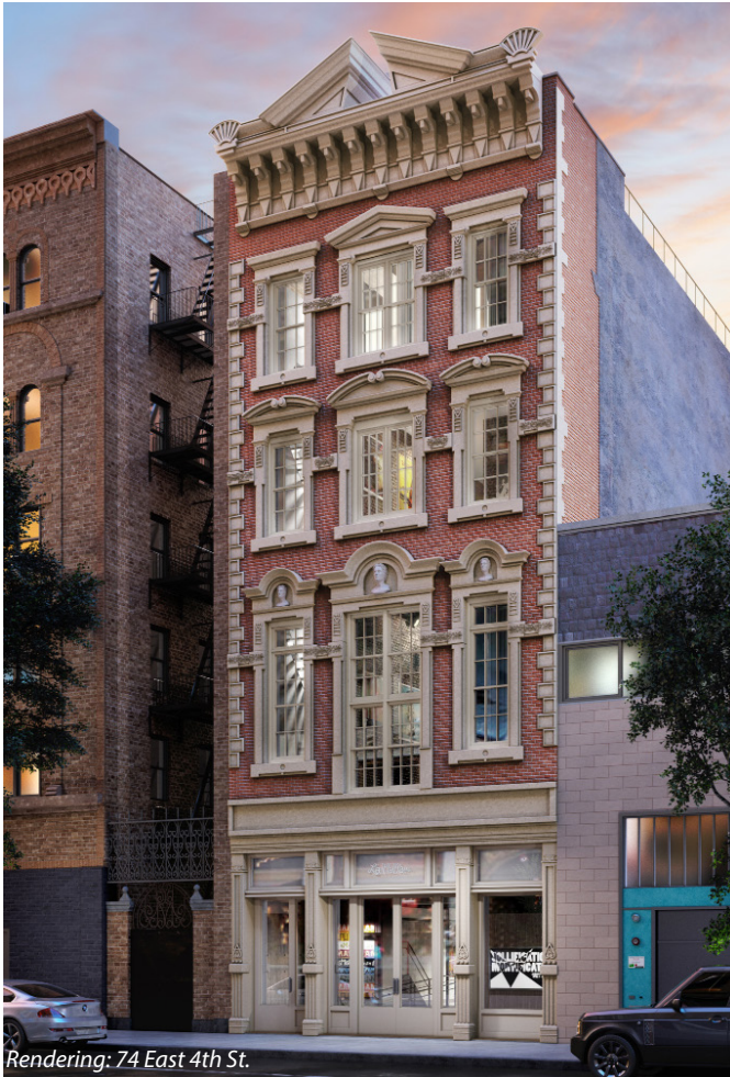
Rendering: 74 East 4th St.

La MaMa's historic, landmark building at 74 East 4th Street underwent an urgently needed complete renovation and restoration to preserve the historic façade, create building-wide ADA accessibility, and provide much needed performance, exhibition and community space for decades to come.